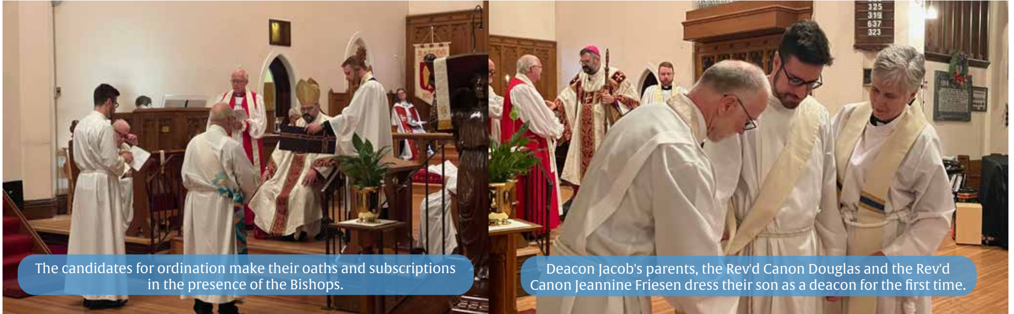
The candidates for ordination make their oaths and subscriptions in the presence of the Bishops.