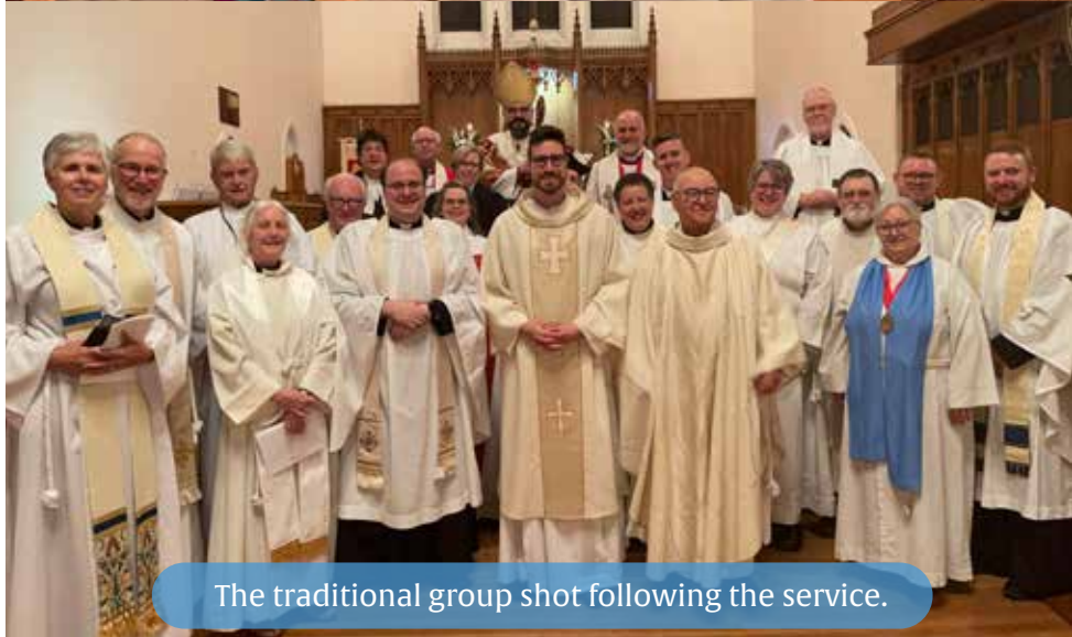
The traditional group shot following the service.