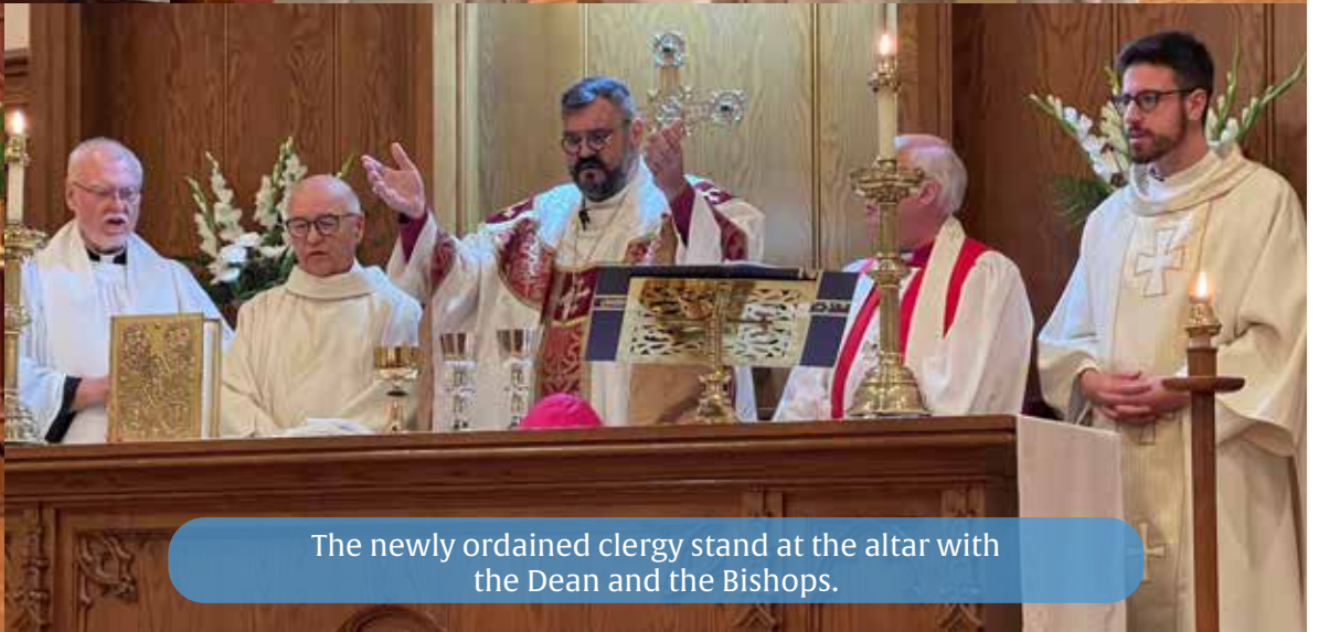
The newly ordained clergy stand at the altar with the Dean and the Bishops.